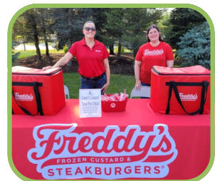
Parties in the Park