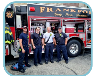
Back To School Bash