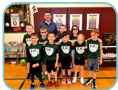
Youth Basketball League