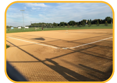
Commissioners Park Softball Field