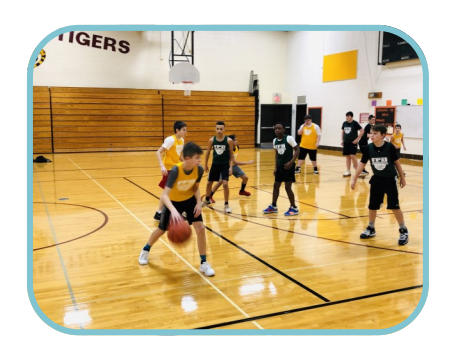
Youth Basketball League