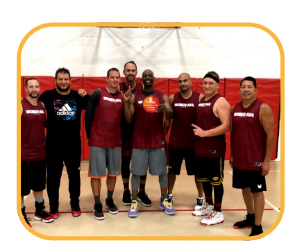
Mens Basketball League