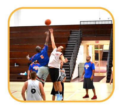
Come Join the Fun!