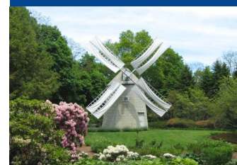
One of Cape Cod's many Windmills

Departure: Frankfort Park District, 140 Oak St, Frankfort, IL @ 8 am