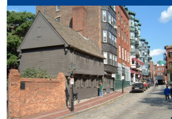
Experience 17th century history in Plymouth, MA