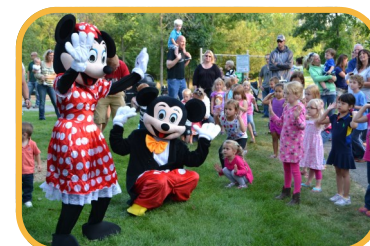
Parties in the Park – June, July & August