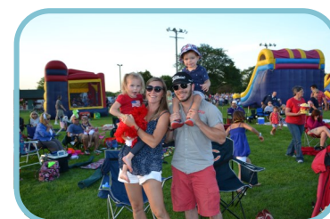
4th of July Celebration